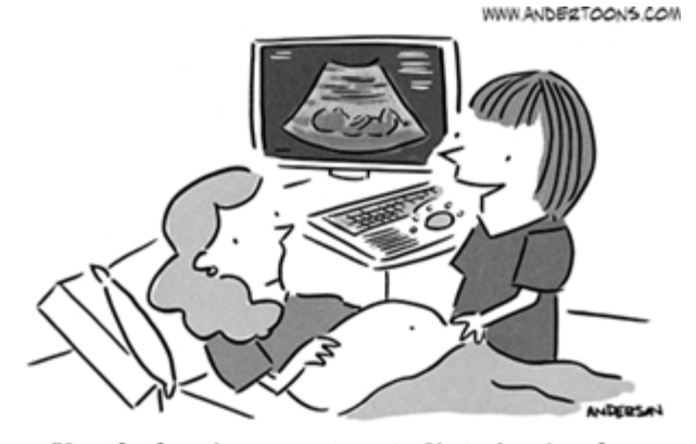
"Just for fun, do you want me to Photoshop in a few more before your husband gets here?"